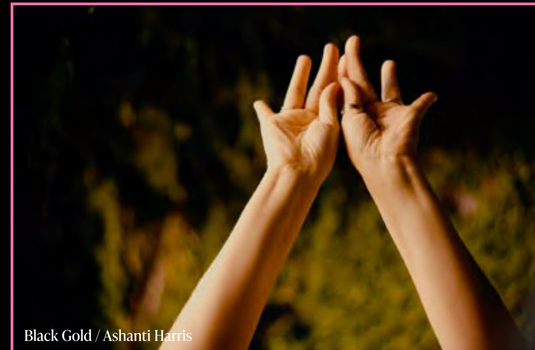
Black Gold / Ashanti Harris