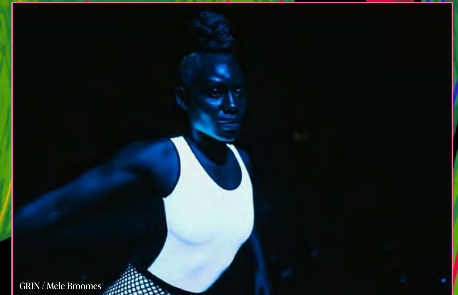
GRIN / Mele Broomes